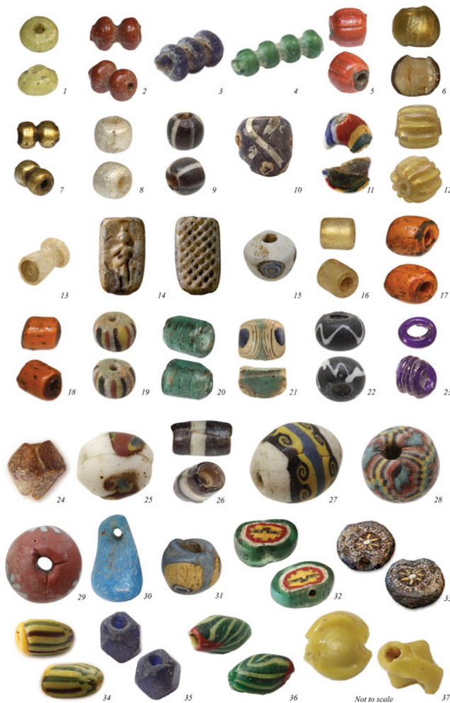
Then-Obluska (p. 214).